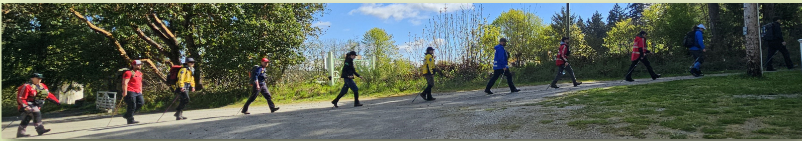
Salt Spring Island SAR Course April 19-21, 2024

Wishing everyone a prosperous 2025 with new friendships formed as we hold courses for our groups of volunteers that give so much.