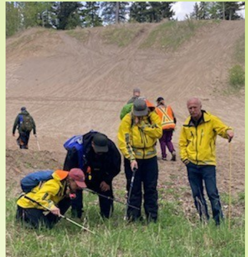
Prince George SAR Course May 24-26, 2024