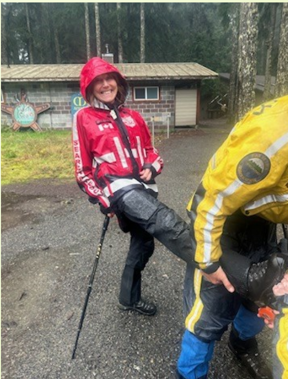
Juan de Fuca SAR Course - after heavy rain Oct 17-20, 2024