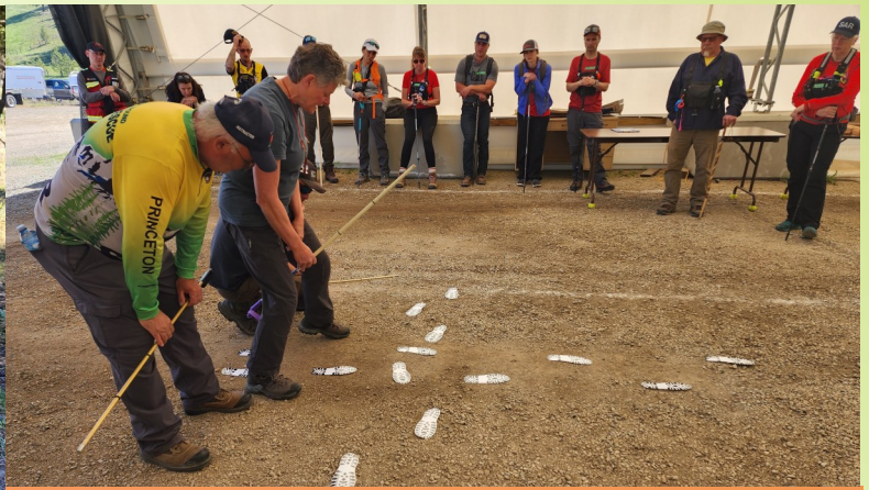
Princeton SAR Course May 10-12, 2024