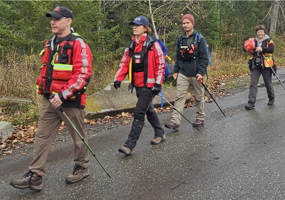
Above: Quesnel SAR Course October 25-27, 2024

As courses are requested, our Training Officer sends an email to all Instructors to see who is available. We currently have 38 active instructors throughout the province. In order to host a course, a minimum of 12 Track Aware Registrants is required, including to assist with hosting a Tracker / Advanced Tracker Course with a minimum of 6 Tracker + Registrants.