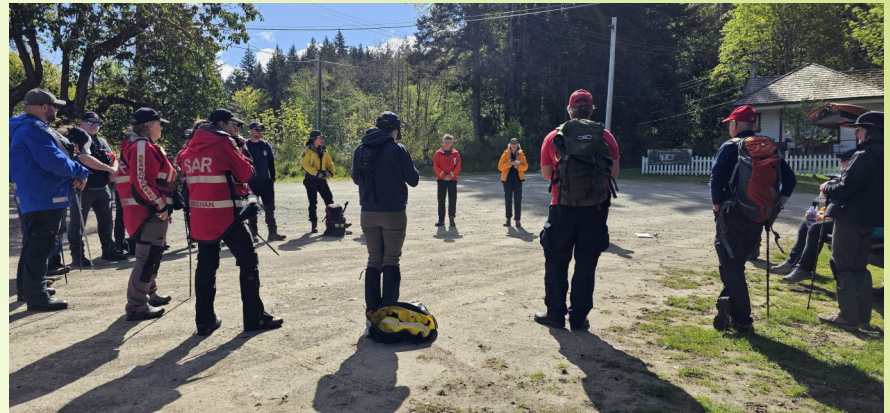
Left: Quesnel SAR Course October 25-27, 2024