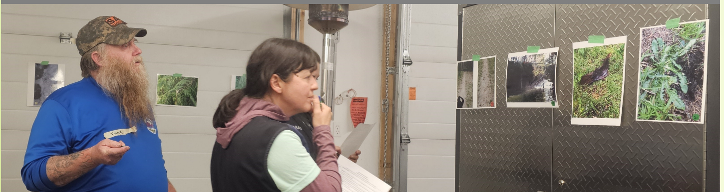
Bottom: Quesnel SAR Course October 25-27, 2024

Each Tracking course is 20 hours, starting Friday evening and ending Sunday early afternoon. It generally takes 60 hours of practice to be Track Aware certified. If you practice with your team and come prepared and show that you meet all the criteria, you will be certified. Certification is not based on how many courses you have taken but on your performance on a course. BCTA has province wide standards that are used to assess students. This way, no matter where you take a BCTA course you will be taught the same procedures and when you go out with your team or on mutual aid, everyone will understand the language you are using and the processes to help locate a missing subject.