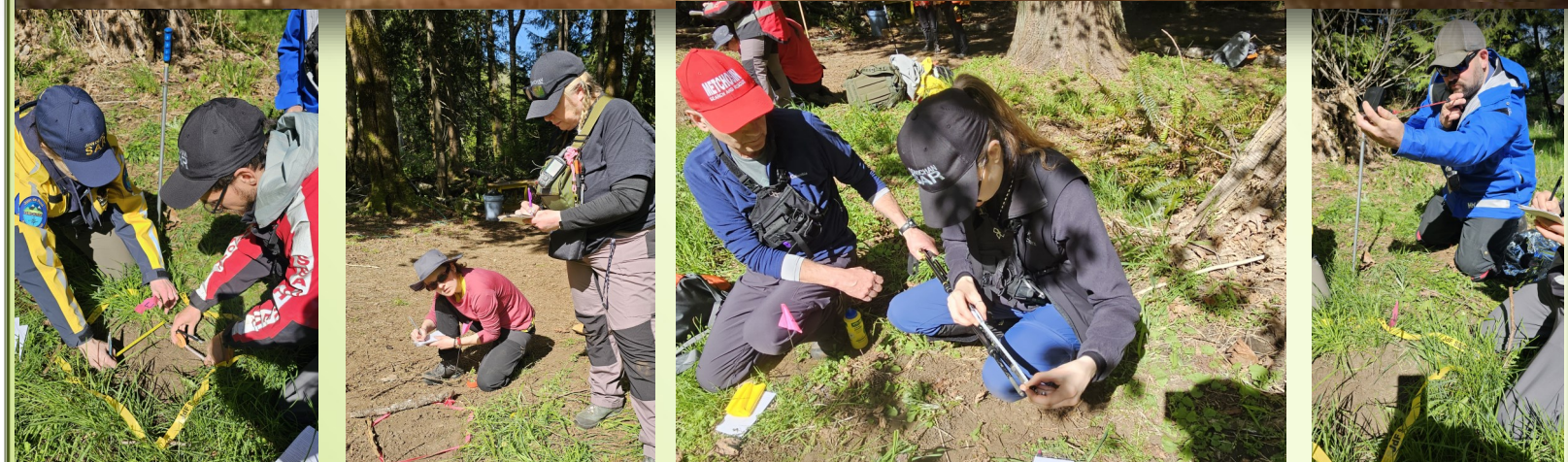
Salt Spring Island SAR Course April 19-21, 2024