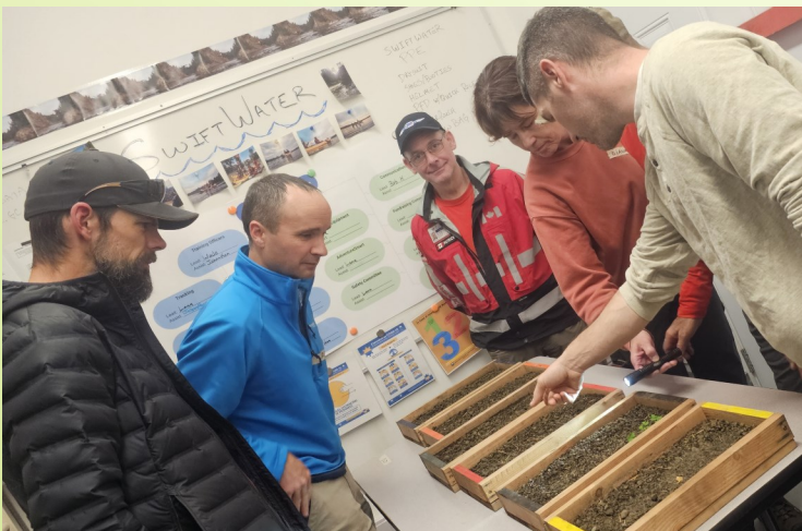
Quesnel SAR Course October 25-27, 2024