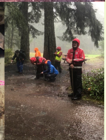
Juan de Fuca SAR Course Oct 17-20, 2024 - triumphant after several inches of heavy rainfall